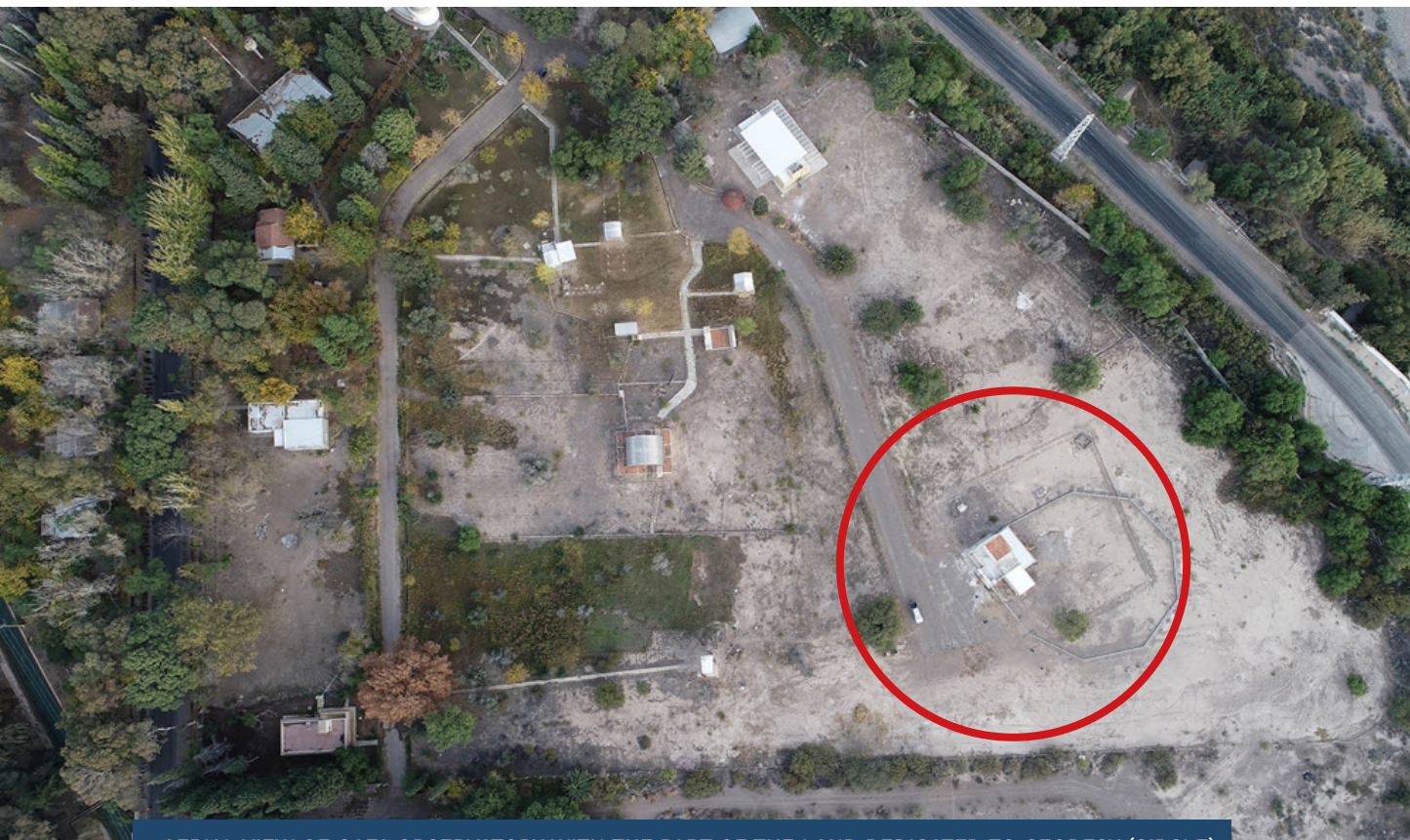
AERIAL VIEW OF Oafa OBSERVATORY WITH THE PART OF THE LAND DEDICATED TO GEODESY (CIRCLE)

in 2014 for a new DORIS site in the area, including several options in Chile, the choice was made for the San Juan observatory. This site offers good environment for the DORIS antenna broadcasting and co-location with other space geodetic techniques: the Satellite Laser Ranging (SLR) station set up by the Chinese Academy of Sciences in 2005 and the permanent GNSS station of the national network RAMSAC (Red Argentina de Monitoreo Satelital Continuo) in operation since 2012. This instrument co-location is of high interest for geodesy and geophysics. With three of the four geodetic techniques contributing to the International Terrestrial Reference Frame (ITRF) realization, San Juan observatory is a core site for the combination of the reference frames of the different techniques into a unique reference frame by introducing terrestrial measurements (tie vectors between co-located instruments). In addition, using the measured station velocities from three different techniques, this co-location will provide essential information for the study of this