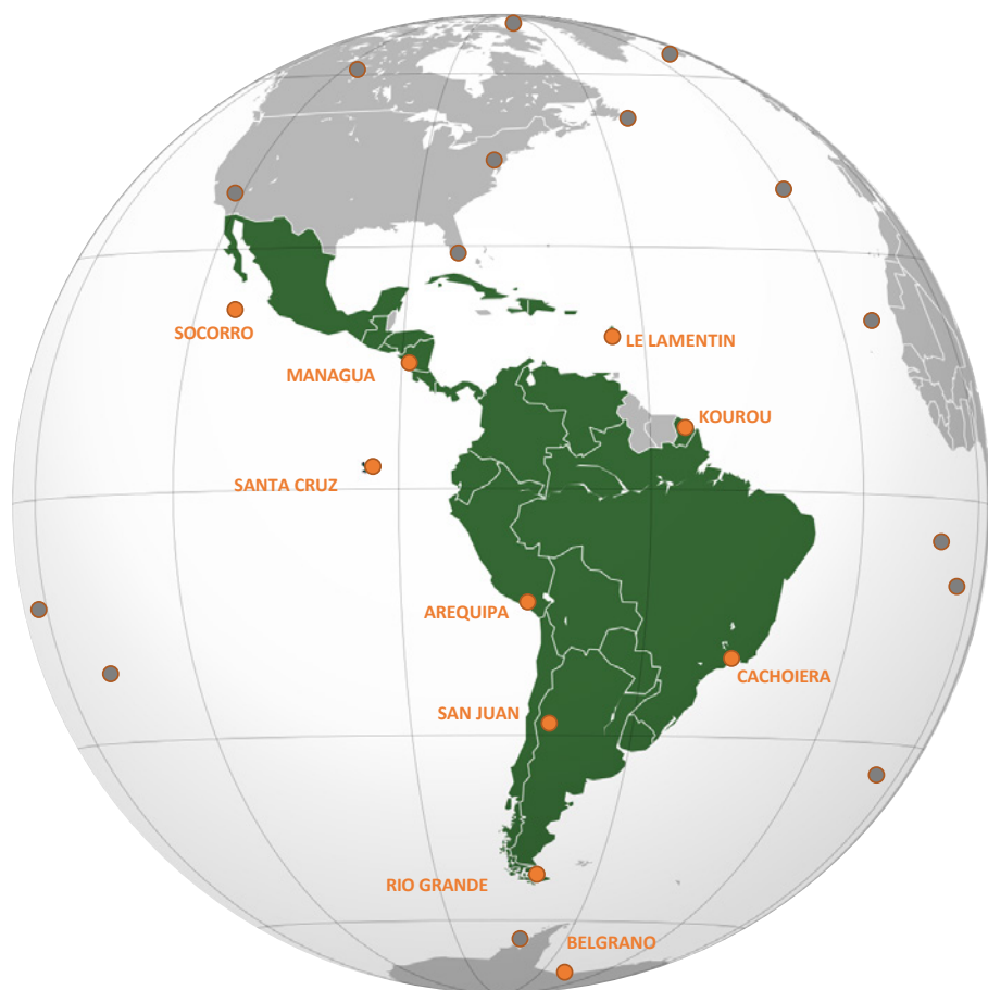
DORIS STATIONS HOSTED BY COUNTRIES OF LATIN AMERICA.

Thus, DORIS as French system forged strong links with its Latin partners who host nine stations of the current ground network: at Socorro (Mexico) with INEGI and the help of the Secretariat of the Navy (SEMAR), Managua (Nicaragua) with INETER, Le Lamentin (West Indies) with Météo-France, Kourou (French Guyana) with CSG, Santa Cruz (Ecuador) with FCD, Arequipa (Peru) with UNSA, Cachoeira-Paulista (Brazil) with INPE, San Juan (Argentina) with UNSJ, and Rio Grande (Argentina) with UNLP.