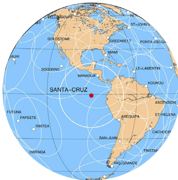
LOCATION AND VISIBILITY CIRCLE OF THE DORIS STATION IN SANTA CRUZ, GALÁPAGOS, ECUADOR

FCD activities (see insert on p. 6) are far away from geodesy or geophysics but the FCD found a common cause to work together because the DORIS system contributes through Earth observation satellites to the study of climate change and they are particularly interested in satellite imagery that constitute essential material for their work of research. With the Santa Cruz DORIS station back to operation, the orbit determination and thus the height measurements from the altimetry satellites will be improved in this area and the co-location with the GNSS station will provide meaningful data to contribute toward the understanding of the complex structure of this area known as hot spot in geological terms. We wish a long and successful life to this station!