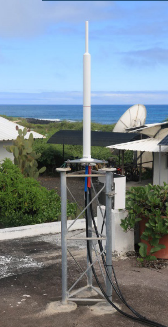
THE DORIS ANTENNA « SCRC » OF SANTA CRUZ