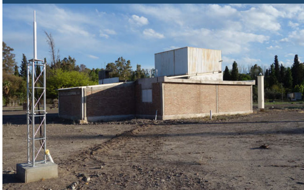
THE DORIS ANTENNA “SJUC” OF SAN JUAN, CO-LOCATED WITH SLR AND GNSS